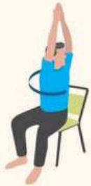
5. Sun Salutations with Twists