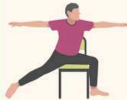
11. Warrior 2