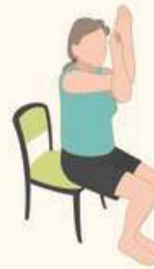
7. Eagle Arms