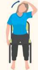
8. Assisted Neck Stretches