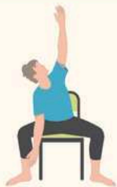
10. Goddess with a Twist