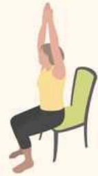
4. Sun Salutation Arms