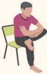
9. Ankle to Knee